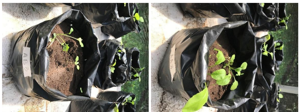
Figure 4. Vegetative Growth Characteristics of Caisin Seed (1 Week After Sowing) with POC and without POC treatment

As a preliminary study, research was conducted on the growth of Caisim ( Brassica rapa L.) planted in polybags with POC treatment and without POC treatment. Significantly, the initial growth of Caisim seeds with POC treatment showed better vegetative morphological characteristics than without POC treatment (Fig. 4). Although further research is needed, several previous studies have proven that the use of POC in vegetable crops has improved soil quality by increasing the nutrients in the soil [6,7].